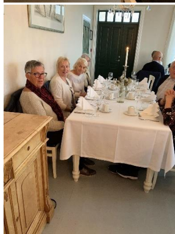
Så fikk vi servering