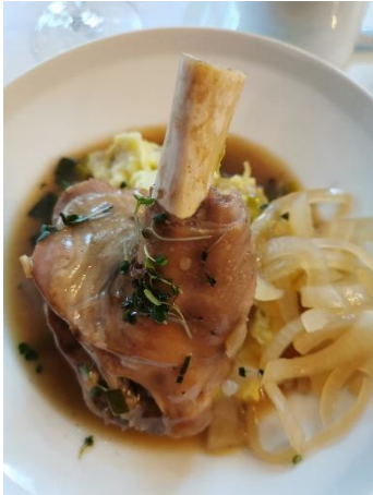
Lammeskank var menyen