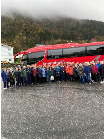
Ankomst Haaheim Gaard